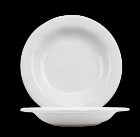
B-110-AM-W Round Bowl 10 oz. 1 dz.