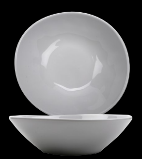
B-18-AM-W Round Bowl 16 oz. 7" dia. 1.75" deep 1 dz.