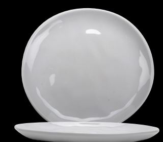
CS-9-AM-W Round Plate 9" dia. 1 dz.