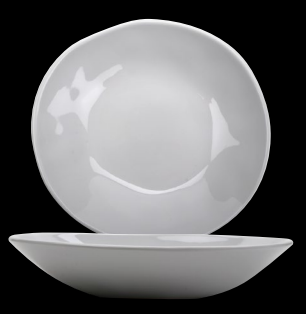
B-42-AM-W Round Bowl 1.3 qt. 10" dia. 1.75" deep 1 dz.