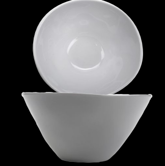
B-22-AM-W Round Bowl 22 oz. 6.25" dia. 2.75" deep 1 dz.