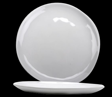
CS-10-AM-W Round Plate 10.5" dia. 1 dz.