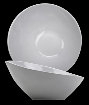
B-792-AM-W Cascading Bowl 24 oz. 9.2" dia. 2.75" deep (front) 4.75" (back) 1 dz.