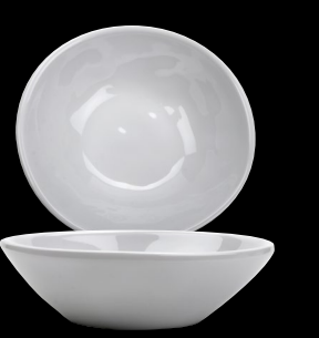
B-5-AM-W Round Monkey Dish 5 oz. 4.25" dia. 1.5" deep 6 dz.