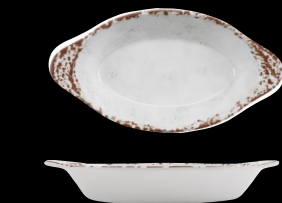
● SD-08-FM Oval Side Dish 10 oz. 8.5" x 4.5", 1.25" Deep 2 dz.