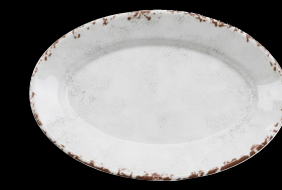
● OP-911-FM Oval Platter 9.25" x 6.25" 2 dz.