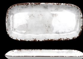
● CS-1576-FM Rectangular Platter 15" L x 7.5" W 12 ea.