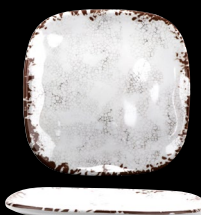
● SCS-6-FM Square Plate 6" dia. 2 dz.