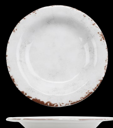
● B-110-FM Round Bowl 10 oz. 1 dz.