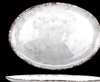
● CS-1813-FM Oval Platter 18" L x 13" W 3 ea.