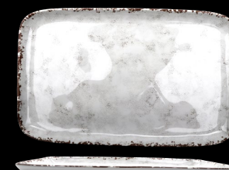
● CS-1814-FM Rectangular Platter 18" L x 11" W 3 ea.