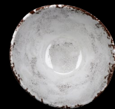
● B-22-FM Round Bowl 22 oz., 6.25" dia., 2.75" H 1 dz.