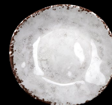
B-42-FM Round Bowl 1.3 qt., 10" dia., 1.75 H 1 dz.