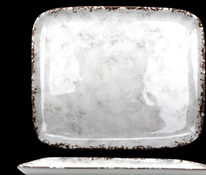
● CS-1412-FM Rectangular Platter 14" L x 11.5" W 6 ea.