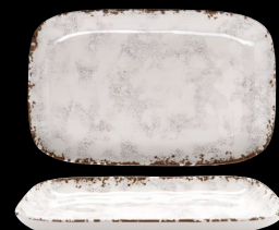
CS-117-FM Rectangular Platter 12" L x 7.5" W 1 dz. Fits Plate Cover LID-CS117-CL