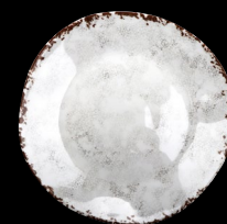
● B-43-FM Round Bowl 28 oz., 10.75" dia., 1" H 1 dz.