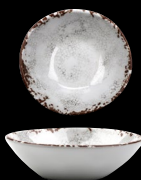
● B-5-FM Round Monkey Dish 5 oz., 4.5" dia., 1.25" H 6 dz.