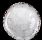
● CS-7-FM Round Plate 7" dia. 1 dz.