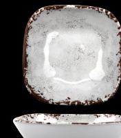
● SB-14-FM Square Bowl 14 oz., 6" L x 1.5" H 2 dz.