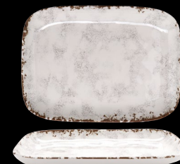
● CS-119-FM Rectangular Platter 12.75" L x 9.5" W 1 dz.