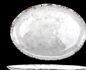
● CS-1511-FM Oval Platter 15" L x 11" W 6 ea.