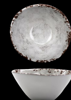
● B-8-FM Round Bowl 8 oz., 5" dia., 2" H 2 dz.