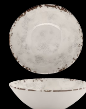
B-18-FM Round Bowl 16 oz., 7" dia., 1.75 H 1 dz.