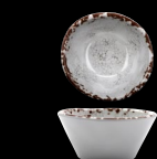
● B-3-FM Round Ramekin 3 oz., 3.25" dia., 1.25" H 6 dz.