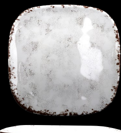
● SCS-9-FM Square Plate 9.5" dia. 1 dz.