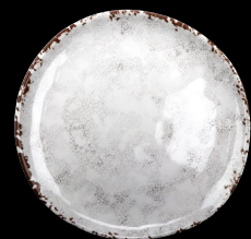
CS-10-FM Round Plate 10.5" dia. 1 dz.