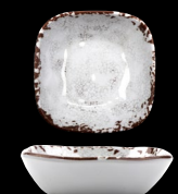
● SB-5-FM Square Monkey Dish 5 oz., 4.25" L x 1" H 4 dz.