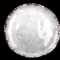
● CS-9-FM Round Plate 9" dia. 1 dz.