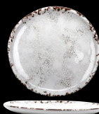
● CS-5-FM Round Plate 5.5" dia. 4 dz.