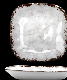
● SB-48-FM Square Bowl 1.5 qt., 10.25" L x 1.75" H 1 dz.