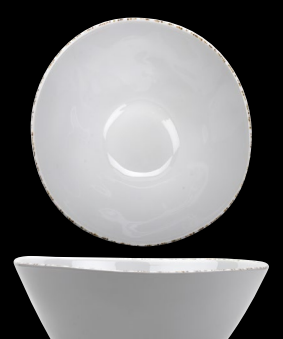
B-193-UM Round Bowl 6 qt. 13" dia. 5.5" deep 3 ea.

SB-410-UM Square Bowl 12.8 qt. 16.75" length 4.5" deep 3 ea.