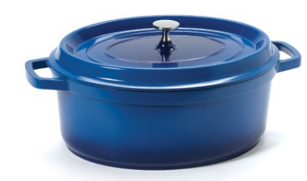
CA-007-CB/BK 6.5 qt. Induction Ready Oval Dutch Oven with Lid 12.13" L x 9.88" W x 4.25" H 1 set