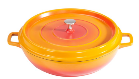
CA-008-0/BK 4.5 qt. Induction Ready Round Braiser with Lid 12.63"dia., 2.88" H 1 set