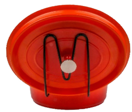
CA-LIDHLDR-5* Wire Lid Holder 7.5" L x 4.5" W 24 ea.