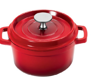
CA-013-R/BK 0.75 qt. Induction Ready Round Dutch Oven with Lid 6" dia., 2.86" H 16 sets