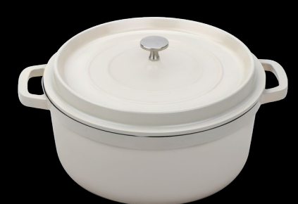
CA-006-AWH/BK/CC 6.5 qt Round Dutch Oven 11" dia., 4.5" H 1 Set