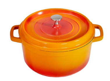
CA-012-0/BK 4.5 qt. Induction Ready Round Dutch Oven with Lid 9.5" dia., 4.25" H 1 set