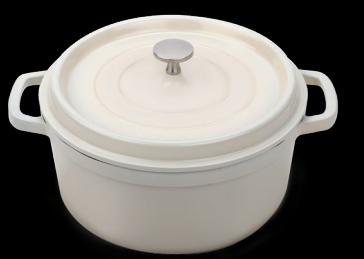
CA-012-AWH/BK/CC 4.5 qt Round Dutch Oven 9.5" dia., 4.25" H 1 Set