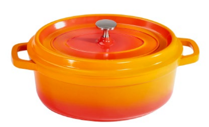
CA-009-0/BK 3.5 qt. Induction Ready Oval Dutch Oven with Lid 10.25" L x 7.88" W x 3.5" H 1 set