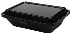
Half Size Food Container

EC-08-1- 4.75" x 4.75", 3.25" tall 2 dz. 12.1 cm x 12.1 cm, 8.3 cm