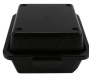
Single Entrée Food Container

EC-10-1- 9" x 9", 3.5" tall 1 dz. 23 cm x 23 cm, 8.9 cm