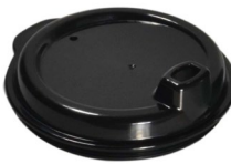
Replacement Lid for EC-124 & EC-116

EC-23-1- 12 oz. (14 oz. rim-full) 1 dz. 4.375" dia. 2.3" tall