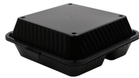
3-Compartment Food Container

EC-09-1- 9" x 9", 3.5" tall 1 dz. 23 cm x 23 cm, 8.9 cm